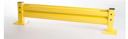
C1-18" Single Rail