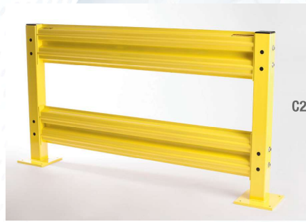
C2-42" Double Rail